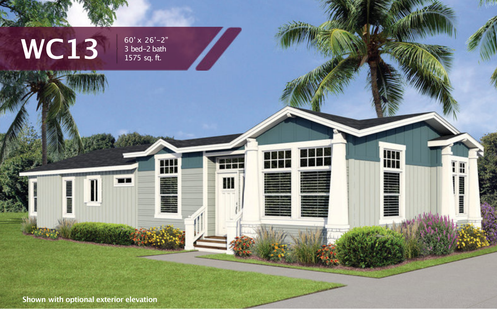
Shown with optional exterior elevation